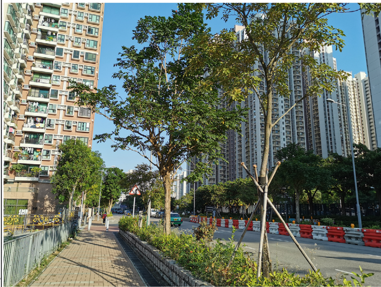
LR11.2 LOCAL TRANSPORTATION CORRIDOR

Date : 9/10/2020 Filename : X:\2514-331A_CE17-2019 (FL GOLF COURSE)\06_Issue Record\20201009_EIA Inception Report\CADD\CE17_EIA_Fig_005.dgn